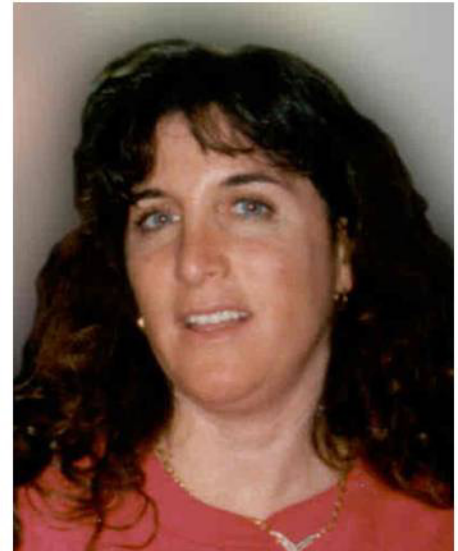
WANTED FOR KIDNAPPING